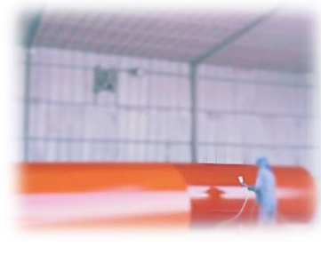
Sewage Pipe – SEWA Project