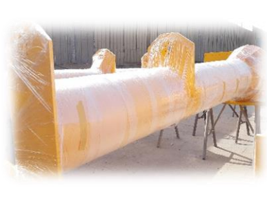
Jib Crane – Government Project