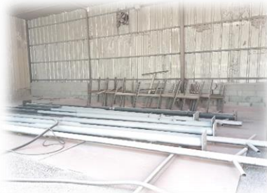
Decorative Street Poles