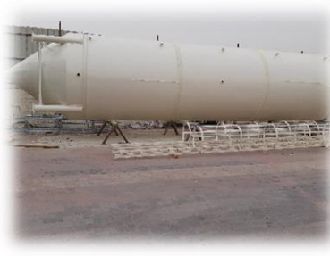
Silo – Cement Factory