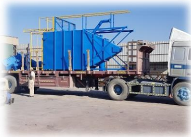
Bag Filter – Cement Factory

- Expert In industrial Sandblasting, Protective Coating & Painting Services