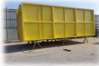
MS Tank – Water Filtration Tanks