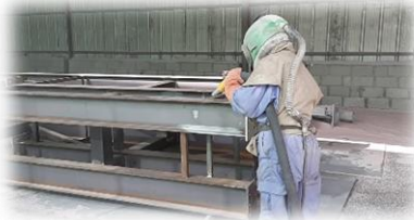
Heavy Structural Oil & Gas Project