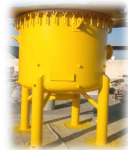
Marine Painting Project - Tank