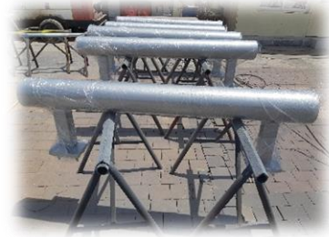
MS Bollard–Amusement Project