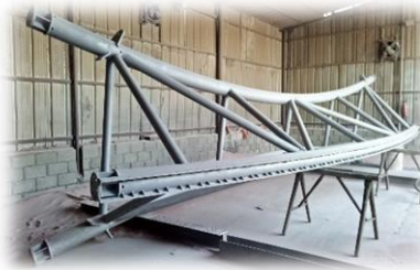
Heavy Steel Structure – School Project In Al Ain