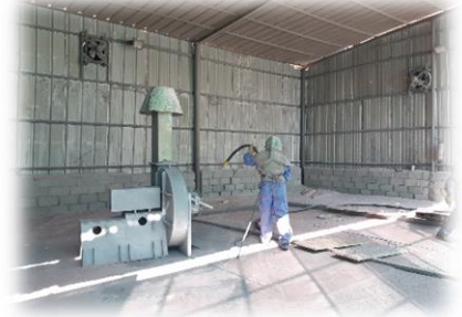
Cement Company Filter System