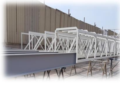
Structural Project – Al Ain School