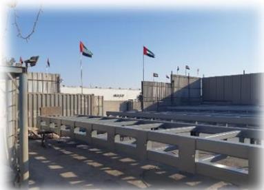
Fujairah Business Center – Heavy Structural Steel Project