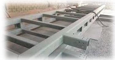
Heavy Structure – Fujairah Business Center Project