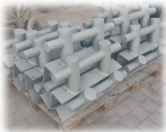
Dry Dock - Bollards