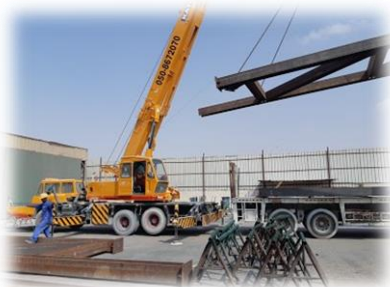
Heavy Structure – Oil & Gas