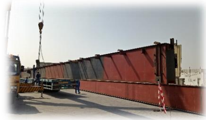
Heavy Over Head Crane Girders Export Project