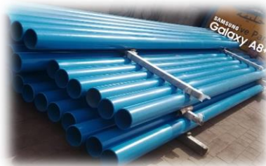
Seamless Pipes – Power Plant