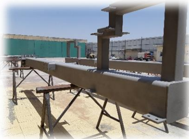
Heavy Structural Project