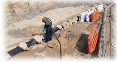
SEWA Site Project